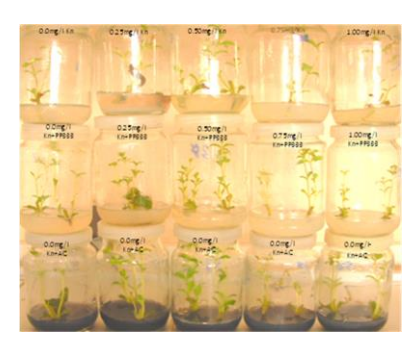
Fig.(2): Effect of balance among Kn concentrations, anti gebrillen (PP333) or activated charcoal on Stevia rebaudiana Bertoni during establishment stage.