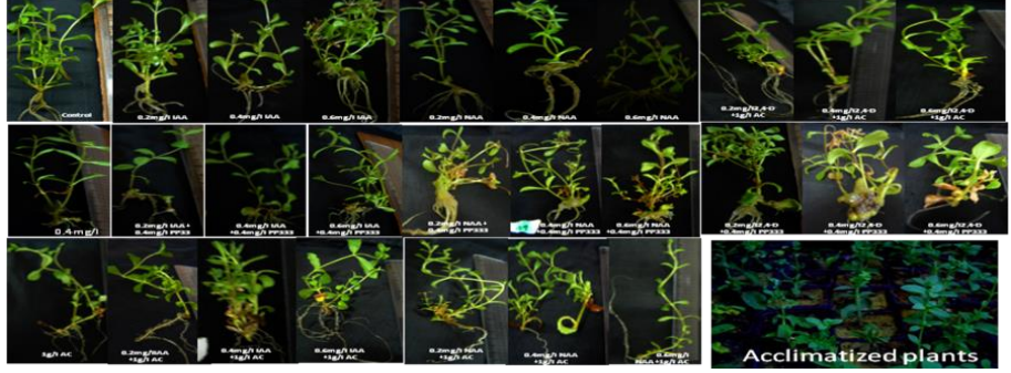
Fig. (4): Effect of balance among concentrations of auxin types and growth retardant (Paclobutrazol PP<sub>333</sub>) and activated charcoal (AC) on root formation and acclimatization of Stevia rebaudiana Bertoni.

Results in Table (4) and Fig.(4) discuss effect of auxin types concentrations individual or in combination with growth retard agent (Paclobutrazol, PP<sub>333</sub>) or activated charcoal (AC) on rooting and acclimatization of Stevia rebaudiana . Results showed that plantlet length of Stevia. rebaudiana possessed its highest values on M.S. media supplemented with no auxin, 0.2mg/l IAA and 0.2mg/l NAA (8.79, 8.46 and8.50cm, respectively).