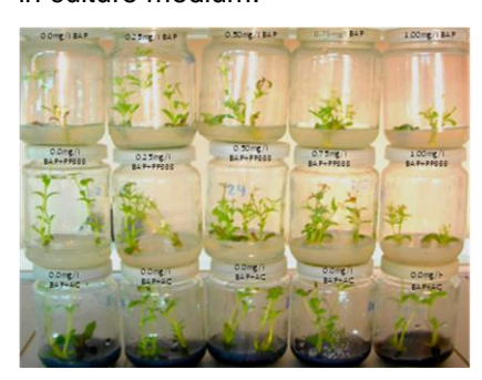
Fig. (1): Effect of balance among BAP concentrations, growth retardant (PP<sub>333</sub>) or activated charcoal on Stevia rebaudiana Bertoni during establishment stage

which may resulted from plant metabolism and lead to unavailable of calcium in culture medium.